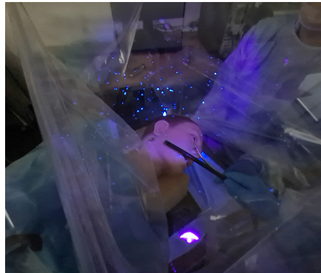
Figure 2 UV droplets visible on the inside roof of endoscopy box.

The box was stable in all of the procedures undertaken with good patient acceptability on an X-ray fluoroscopy table for ERCP and a standard trolley for EUS. The patients were reassured by positioning them first without the EBOX, then sliding the EBOX in place before applying the drapes. Drape application took less than 1 min by the final case in the series, as the technique evolved. The endoscopist and the airway